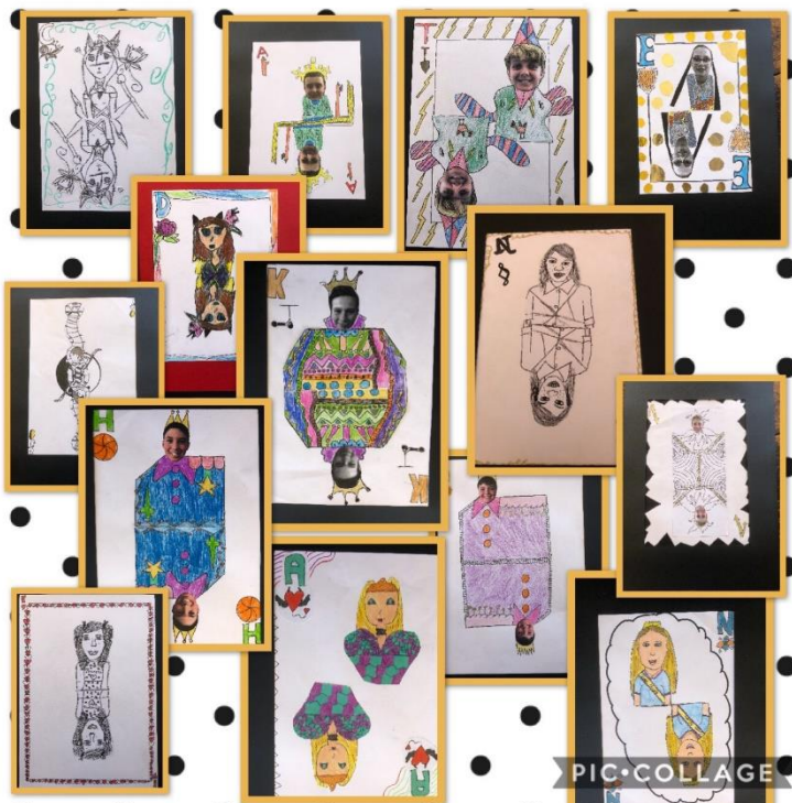
Some of our Grade 5/6 self portrait work that will be on display

Colac Otway Arts Trail: As part of the Colac Otway Arts Trail (17 th and 18 th March) our Grade 5/6 students have created self-portraits which will be on display at The Colac Library – 173 Queen Street. Our students work is part of a collaborative project, with other local primary schools work also on display in a “Mini Archibald” exhibition. The work will be on display at the Library until the end of March but as part of the Trail the Library will be open on Saturday 17 th March 9am-12pm . For more information about the Colac Otway Arts Trail visit the website www.colacotwayartstrail.com or the Facebook page – there is LOTS to see and do.